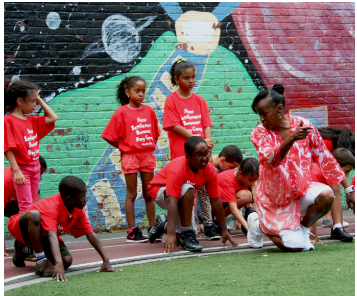
Olympic Gold-Medalist Jackie Joyner-Kersey with kids from our Community Schools Program.